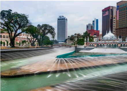
River of Life, Kuala Lumpur

Client: Ikano Pte Ltd (part of IKANO Asia) Services: Full project management services of the design, procurement of contractors/vendors and construction