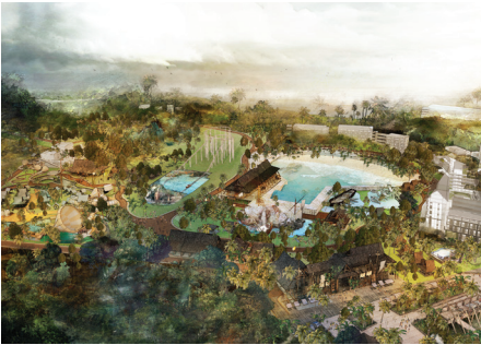
Desa Desaru Hotel, Johor

AirAsia Headquarters, Kuala Lumpur Client: AirAsia Services: Mechanical and electrical, environmental sustainable design, fire engineering, cost management