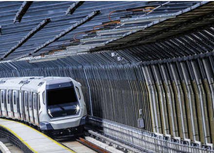
Klang Valley MRT, Kuala Lumpur

Client: MMC Gamuda KVMRT (PDP) Sdn Bhd Services: Multidisciplinary engineering design, associated major site supervision works for underground and elevated sections, cost consulting