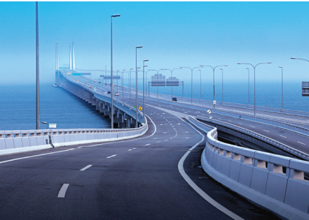
Penang Bridge 2

Client: Desaru Estate Sdn Bhd Services: Project management