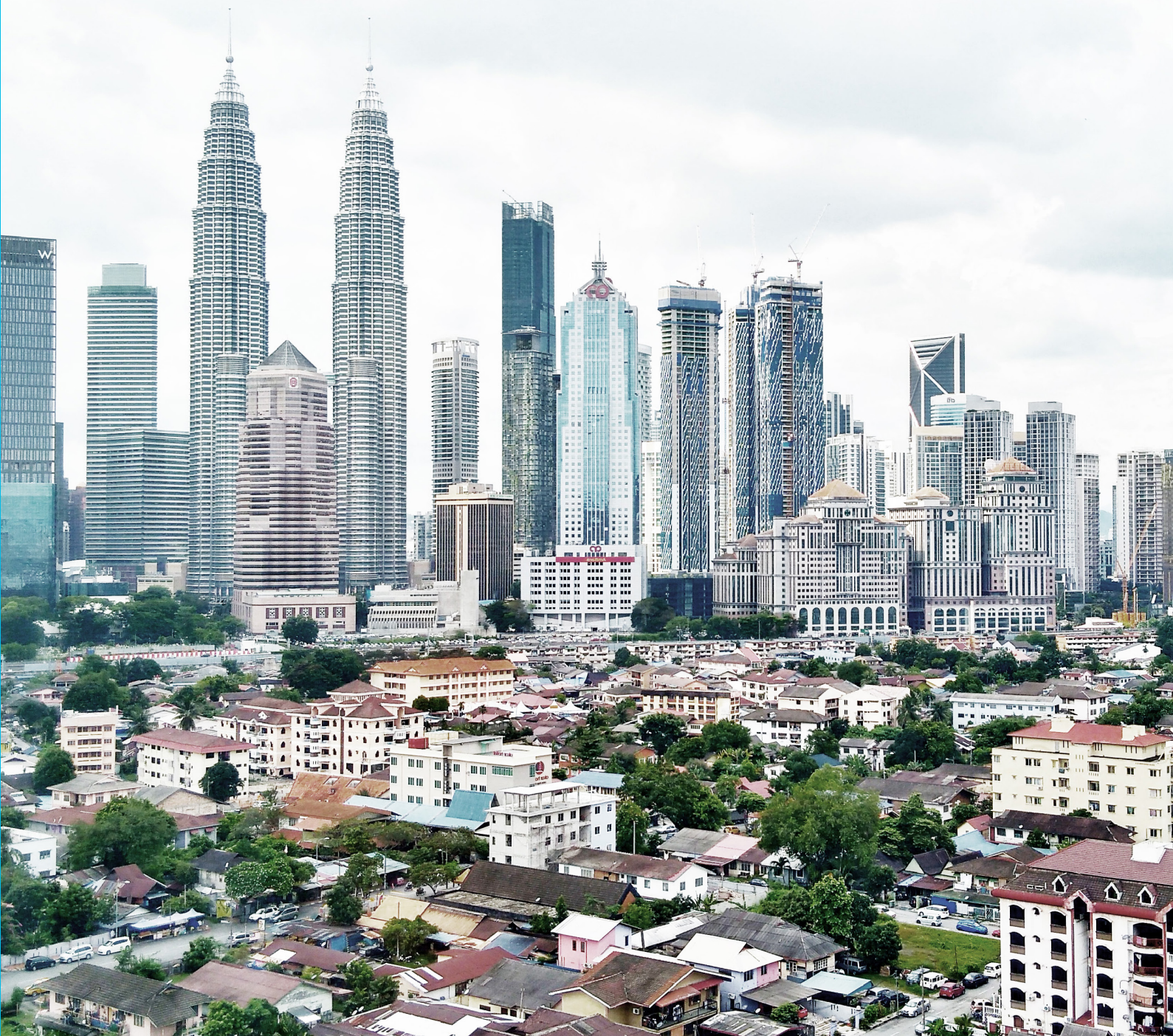
River of Life, Kuala Lumpur, Malaysia