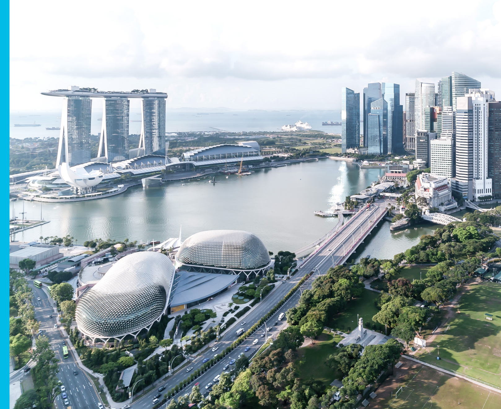
Singapore – Kuala Lumpur, High-Speed Rail: Singapore Stretch Infrastructure