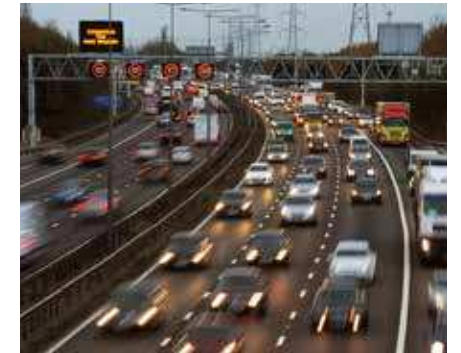
We provided preliminary and final design services for England's Smart Motorways.

We investigated the technical readiness to support the deployment of automated and connected vehicles for the New Zealand Transportation Agency. This research focuses on the necessary infrastructure, technologies and systems to support advanced levels of vehicle automation and connected vehicles. Our analysis was primarily focused on three areas: emerging vehicle technology, intelligent network management and shared mobility.