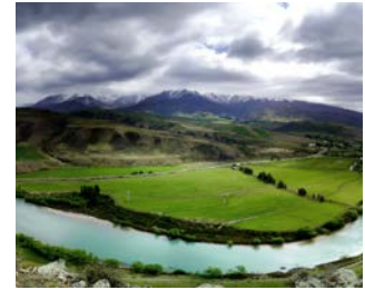
From left: La Grande-2 Underground Hydroelectric Powerhouse (5,616 MW) Québec, Canada