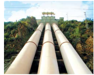
From left: Prado Dam, Gates and Control Tower Replacement Corona, California, U.S.A. AECOM provided services to the US Army Corps of Engineers to raise the dam by 65 feet, and to replace the gates and control tower at the Prado Dam. The improved storage and release capacities of the dam that were achieved through this project enable the dam to take full advantage of the improved channel capacity downstream. They also greatly increased the level of flood protection to the communities of Orange County in the Santa Ana River floodplain.