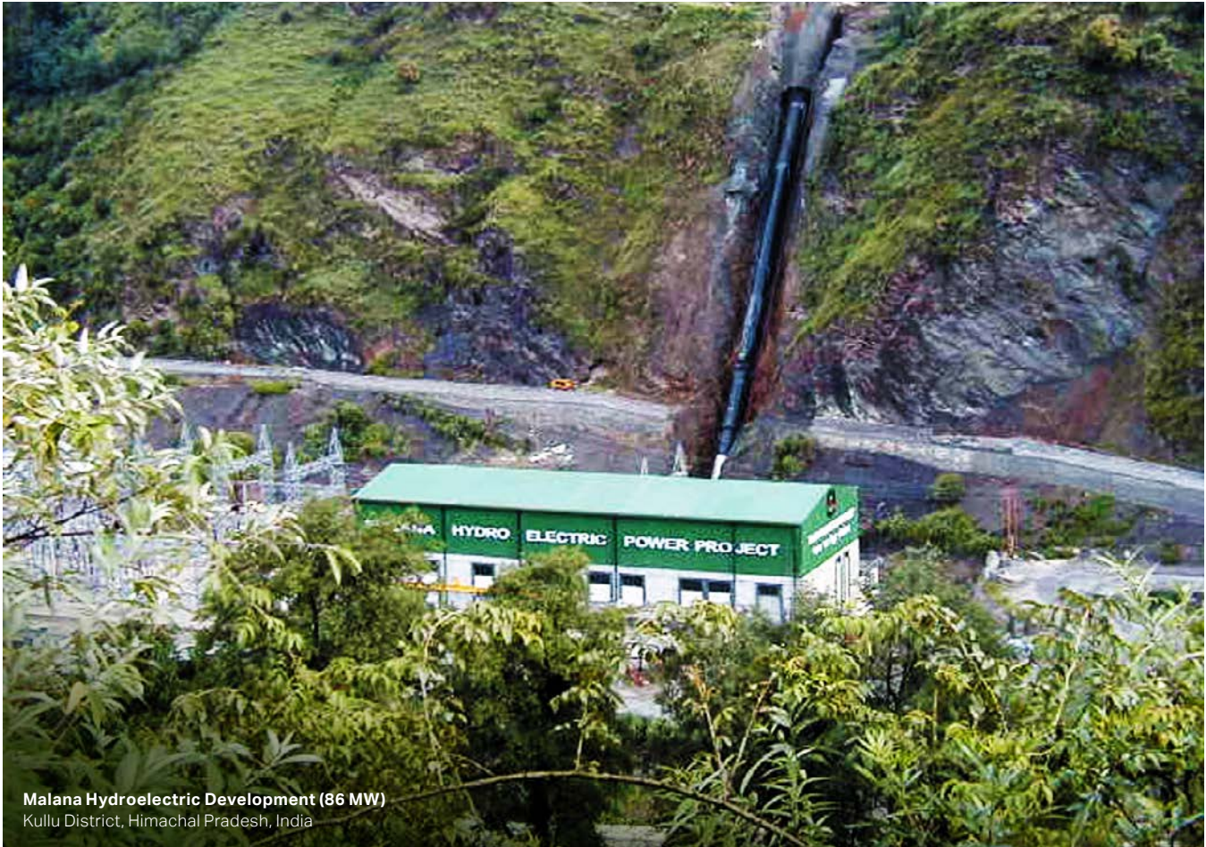
Malana Hydroelectric Development (86 MW) Kullu District, Himachal Pradesh, India

At AECOM, we know that the best foundation for successfully managing programs and projects is an in-depth understanding of our client's individual requirements. This understanding, combined with risk management, timely communication and robust project controls and reporting, has earned AECOM a reputation for management excellence around the world.