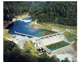
From top: Diamond Valley Lake Winchester, California, U.S.A.