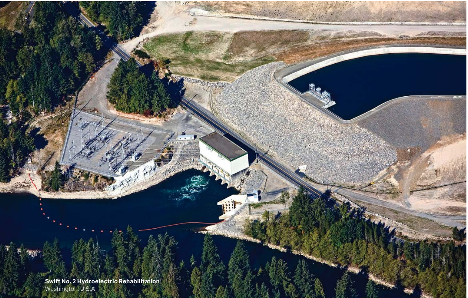
Swift No. 2 Hydroelectric Rehabilitation Washington, U.S.A.

AECOM provides comprehensive services for planning, design and construction as well as rehabilitation of power plants and associated equipment, including mechanical, civil, structural and electrical.