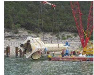
From top: In-situ Water Quality Data Acquisition at the Kissimmee River Aquifer Storage Recovery Pilot Site Okeechobee, Florida, USA Water Treatment Plant No. 4, Raw Water Tunnels and Deep Water Intake Austin, Texas, USA