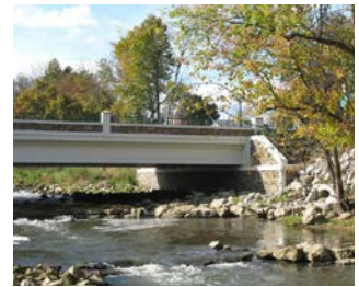
From top: Watershed Management Plans San Francisco, California, USA Mill Creek Dam Removal and Stream Restoration Dexter, Michigan, USA