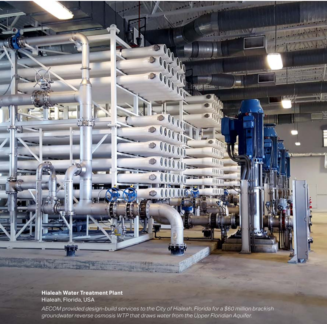
Hialeah Water Treatment Plant Hialeah, Florida, USA

AECOM provided design-build services to the City of Hialeah, Florida for a $60 million brackish groundwater reverse osmosis WTP that draws water from the Upper Floridian Aquifer.