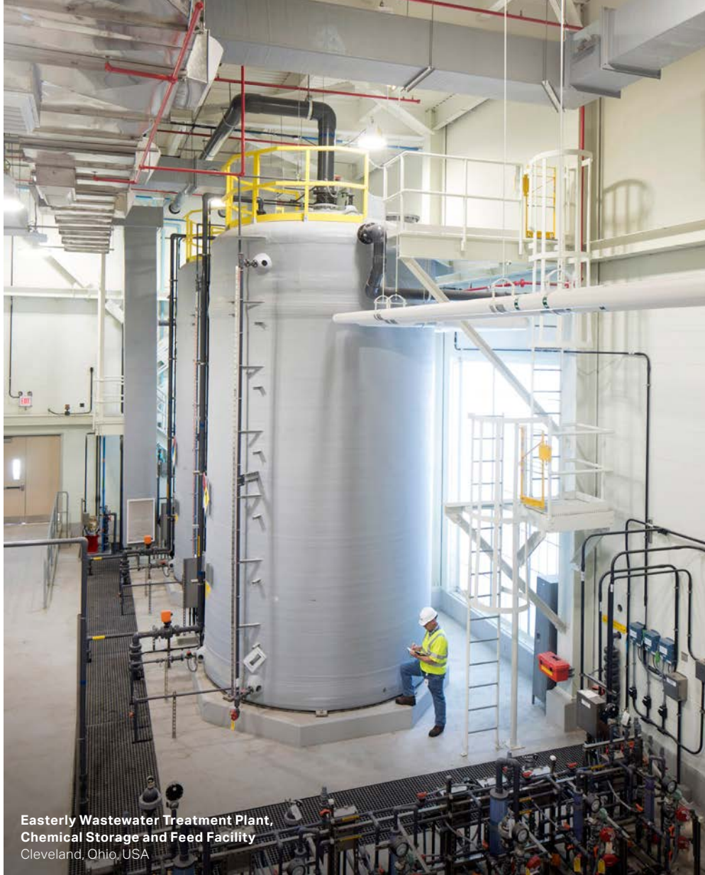
Easterly Wastewater Treatment Plant, Chemical Storage and Feed Facility Cleveland, Ohio, USA