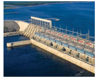
From top left: Lake Travis Raw Water Intake Austin, Texas, USA