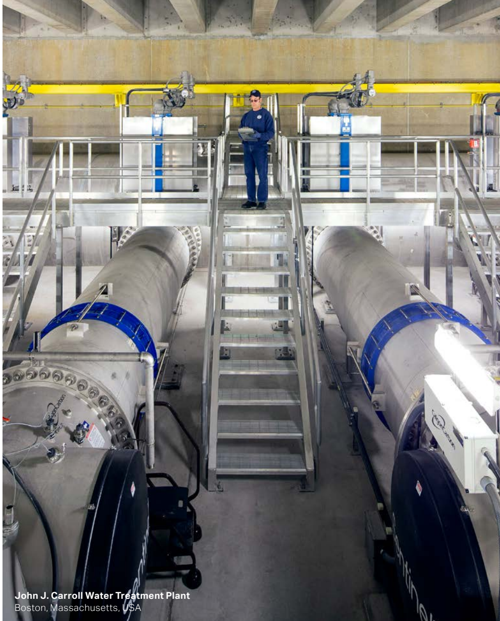
John J. Carroll Water Treatment Plant Boston, Massachusetts, USA