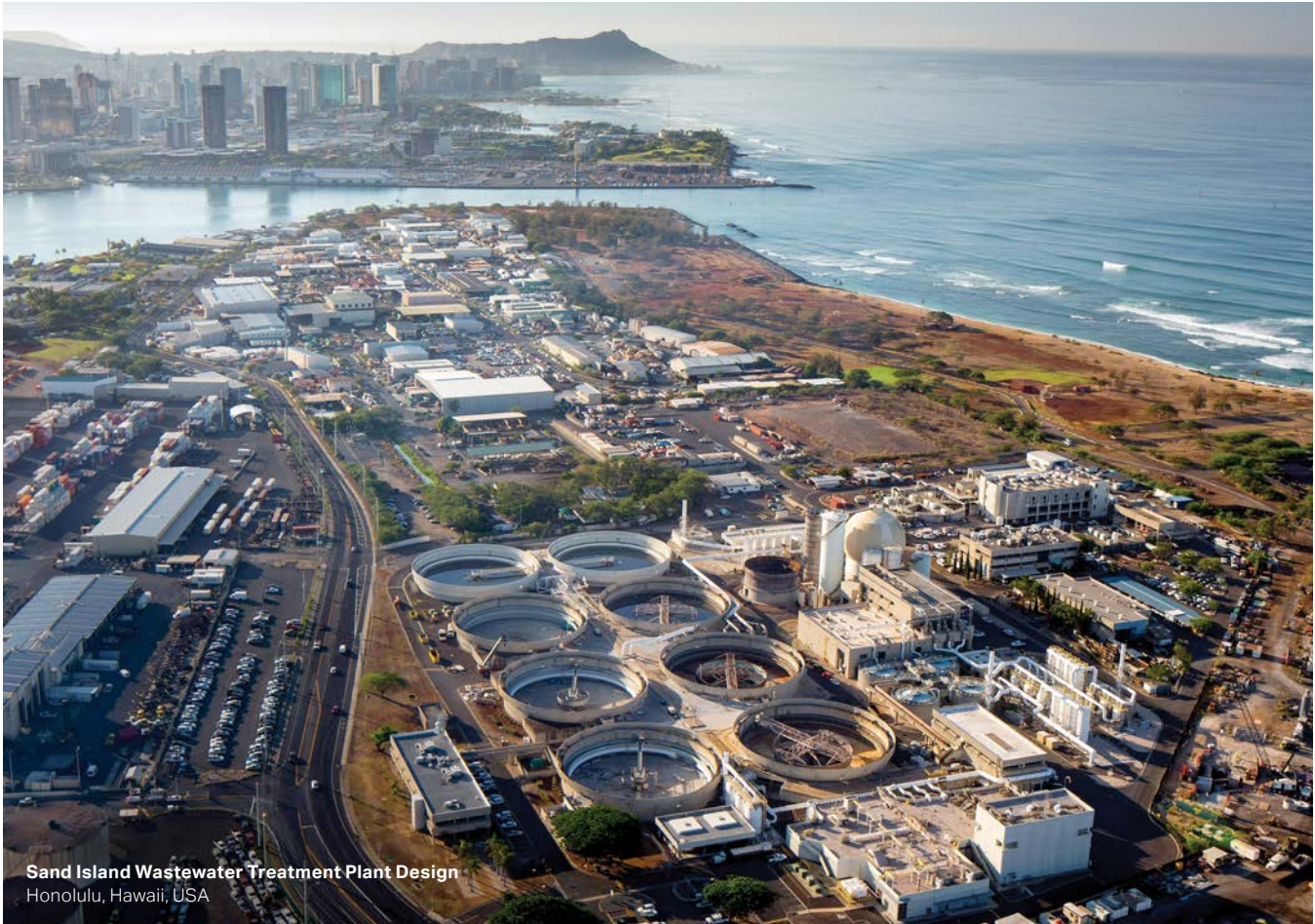
Sand Island Wastewater Treatment Plant Design Honolulu, Hawaii, USA