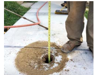
From top: Advanced Water Purification Facility Oxnard, California, USA