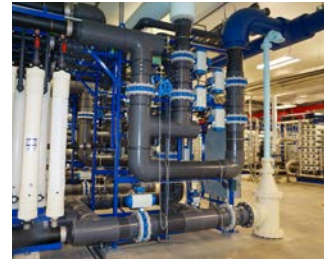
From top: Davie Water and Wastewater Treatment Plants Davie, Florida, USA Delaware Lime Softening Surface Water Treatment Plant Filtration Improvements Delaware, Ohio, USA

Population growth, demographic changes and environmental influences are changing our approaches to water treatment and supply. Increased human activity impacts the watershed, challenging our water supplies in addition to climate variation that stresses our water systems. Climate variation is observed through more frequent and intense precipitation events, longer and often warmer summer months that can also develop into periods of extended drought. Add to the challenges of managing increasingly complex infrastructure and in many cases aging infrastructure then it becomes clear that a full detailed understanding of our water