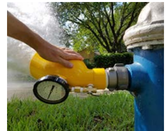
From top: San Francisco WSIP New Irvington Tunnel San Francisco, California, USA

Water and Distribution Sustainability Contract Houston, Texas, USA AECOM with the City of Houston in optimizing and sustaining water quality and infrastructure throughout the City's water treatment and distribution systems. Strategic initiatives executed included the development of a City-wide nitrification action plan, reduction of disinfection by-products, piloting unstaffed remote water quality monitoring stations, enhancement of the City's leak detection program, and conducting the Partnership for Safe Drinking Water's Distribution System Self-Assessment.