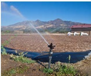
Fillmore Water Recycling Plant Fillmore, California, USA AECOM provided construction and program management services and was the owner's representative for the state-of-the-art water recycling plant (WRP) under a design-build-operate approach. The $43 million WRP used membrane bioreactor wastewater treatment technology to meet the City of Fillmore's water quality and environmental improvement goals.

Our wastewater clients need to do more with less. New regulatory and service demands often place a heavy burden on aging wastewater infrastructure, outdated technologies and tightening budgets.