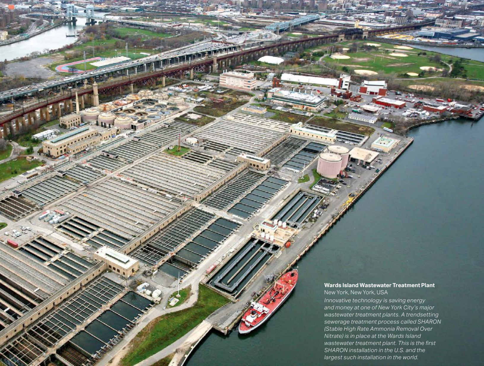
Wards Island Wastewater Treatment Plant New York, New York, USA

Innovative technology is saving energy and money at one of New York City's major wastewater treatment plants. A trendsetting sewerage treatment process called SHARON (Stable High Rate Ammonia Removal Over Nitrate) is in place at the Wards Island wastewater treatment plant. This is the first SHARON installation in the U.S. and the largest such installation in the world.