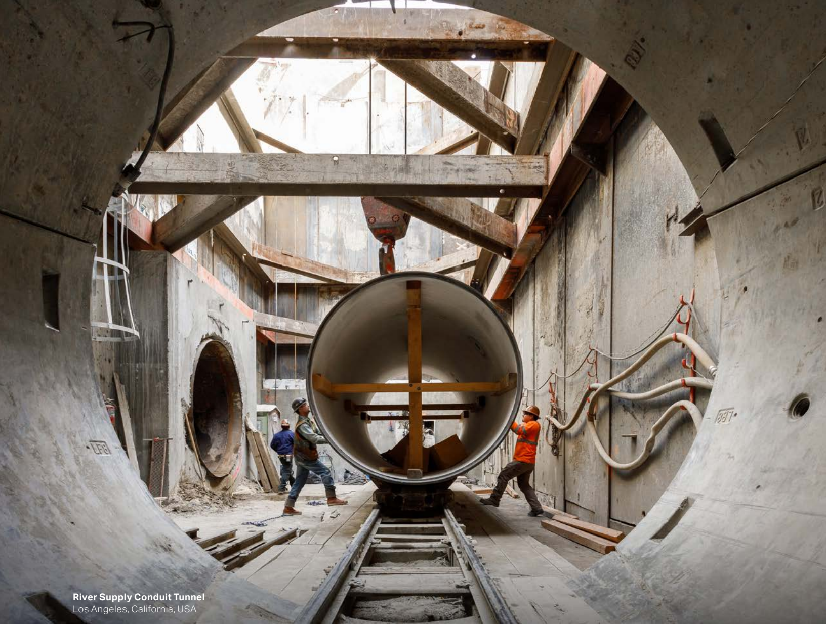
River Supply Conduit Tunnel Los Angeles, California, USA

Backed by years of municipal expertise, we deliver strategies that blend innovation with flexibility to ensure our clients' current infrastructure planning prepares them effectively for the future, especially when funding, schedule or regulatory challenges exist.