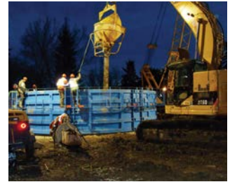
From top: Government Cut Force Main Replacement Miami, Florida, USA Bowness Sanitary Offload Trunk Calgary, Alberta, Canada