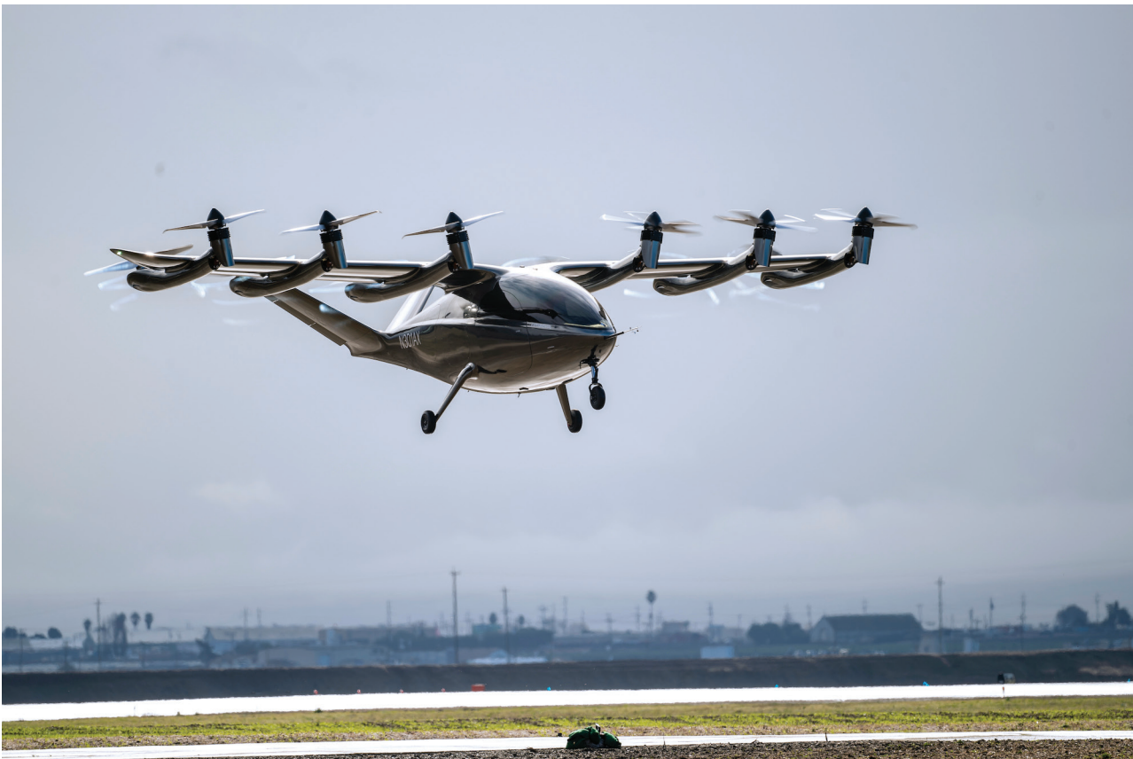
Figure 1 eVTOL

These aircraft present opportunities and obstacles for airport operations.