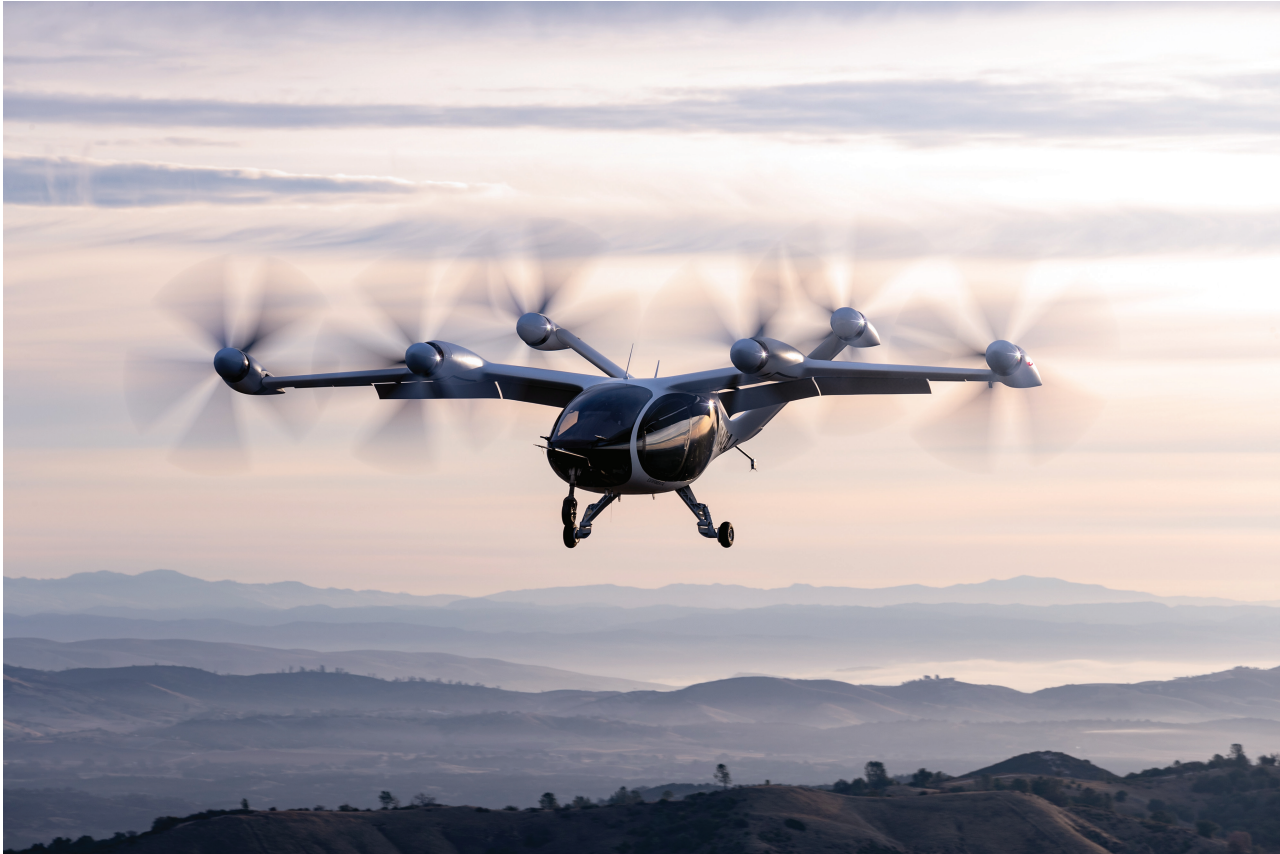
Figure 5 eVTOL image courtesy of Joby Aviation

eVTOL equipment manufacturers, vertiport companies, eVTOL operators and manufacturers, and experts across the European Union, the EASA document lays out specific guidelines for vertiports, including a unique funnel-shaped area above each vertiport designated as ‘obstacle-free volume’ zones.