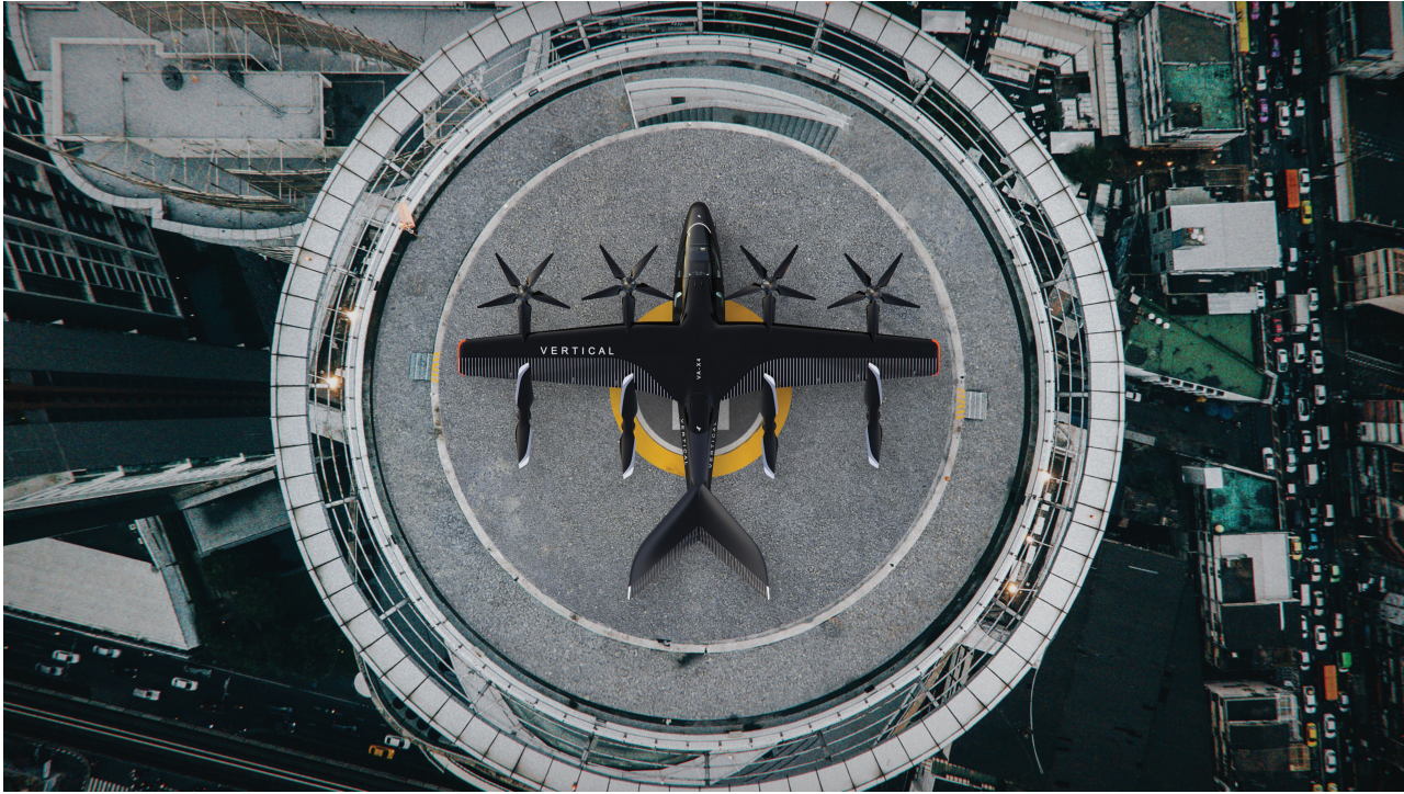
Figure 2 eVTOL

behind the eVTOL to ensure cost effectiveness and practicality.