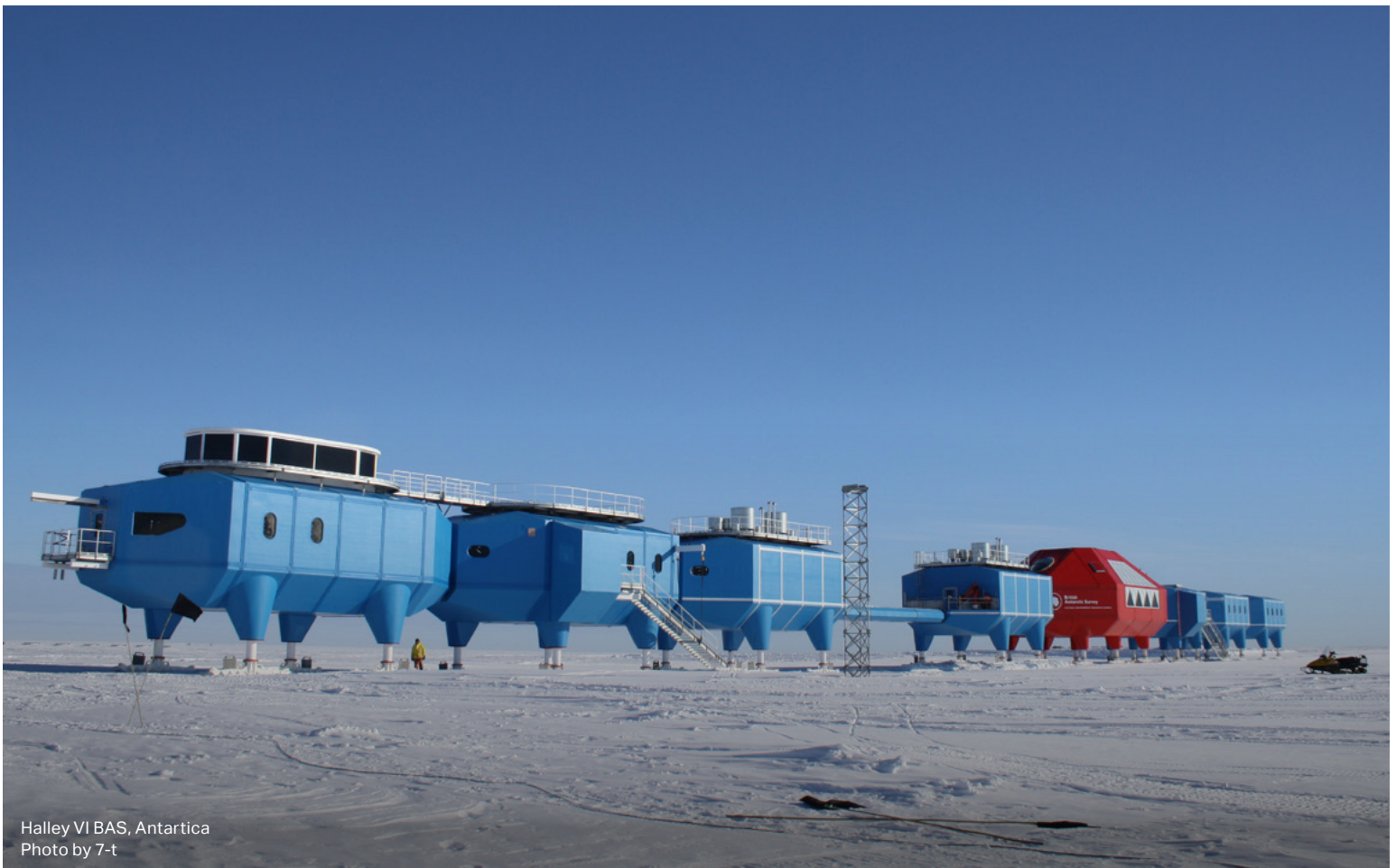
Halley VI BAS, Antarctica

It is important to raise questions and come forward with our concerns. Doing so reinforces our commitment to act ethically in every business decision we make. Early detection also allows AECOM to address concerns before they become widespread problems, and to take corrective action if necessary. Above all, AECOM is committed to maintaining a culture where each of us feels comfortable asking questions, speaking up and working toward solutions.