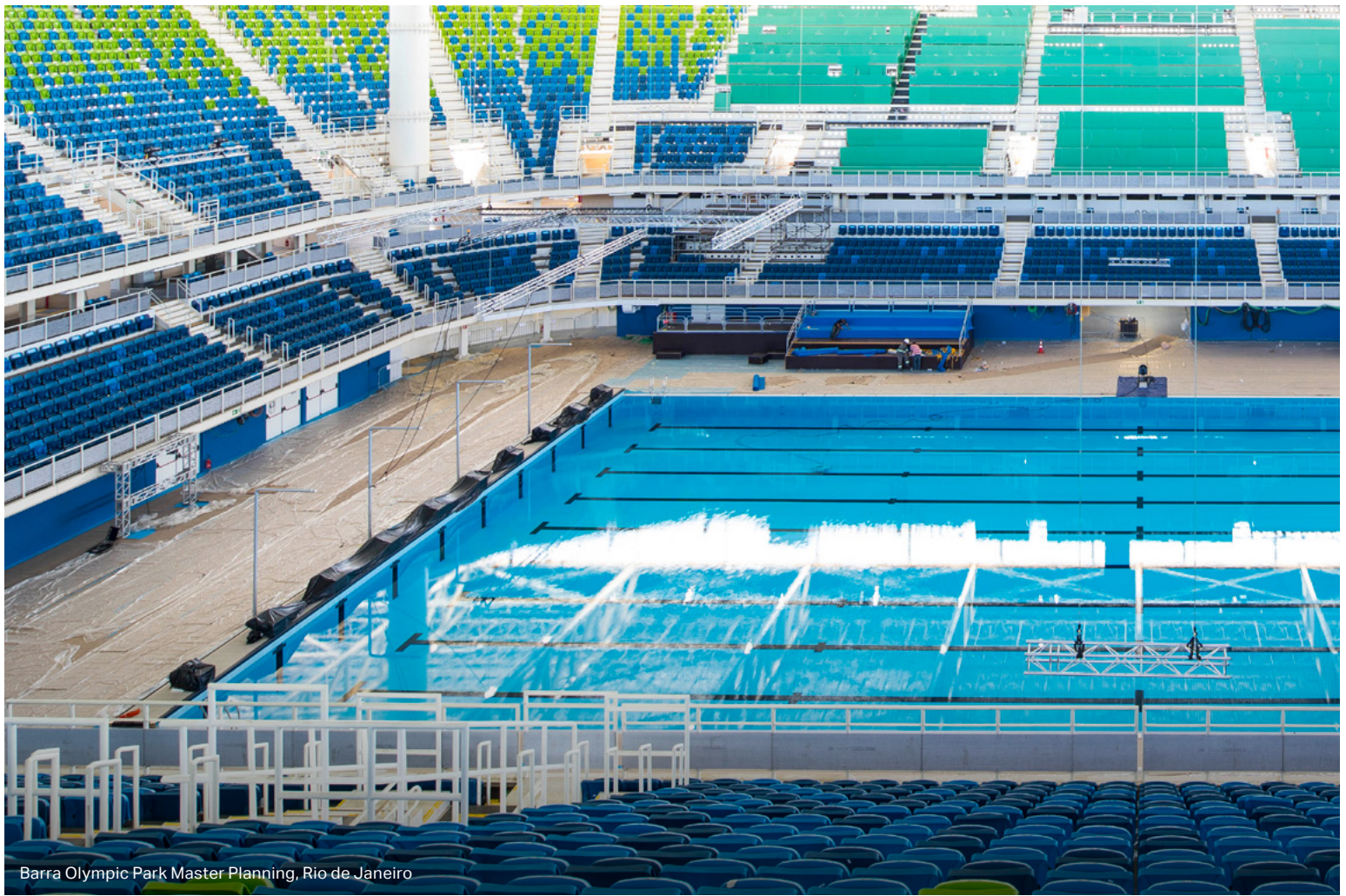
Barra Olympic Park Master Planning, Rio de Janeiro