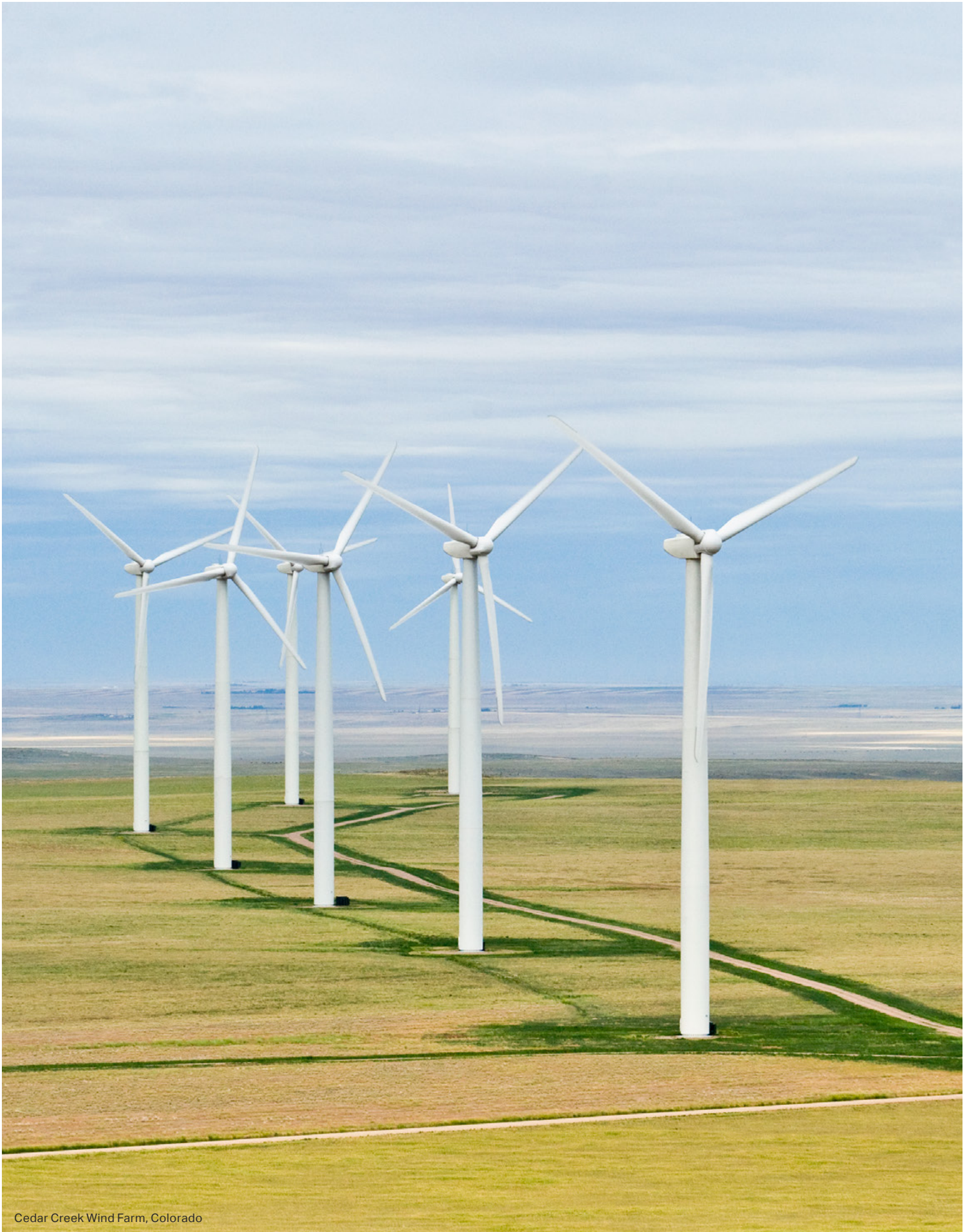
Cedar Creek Wind Farm, Colorado