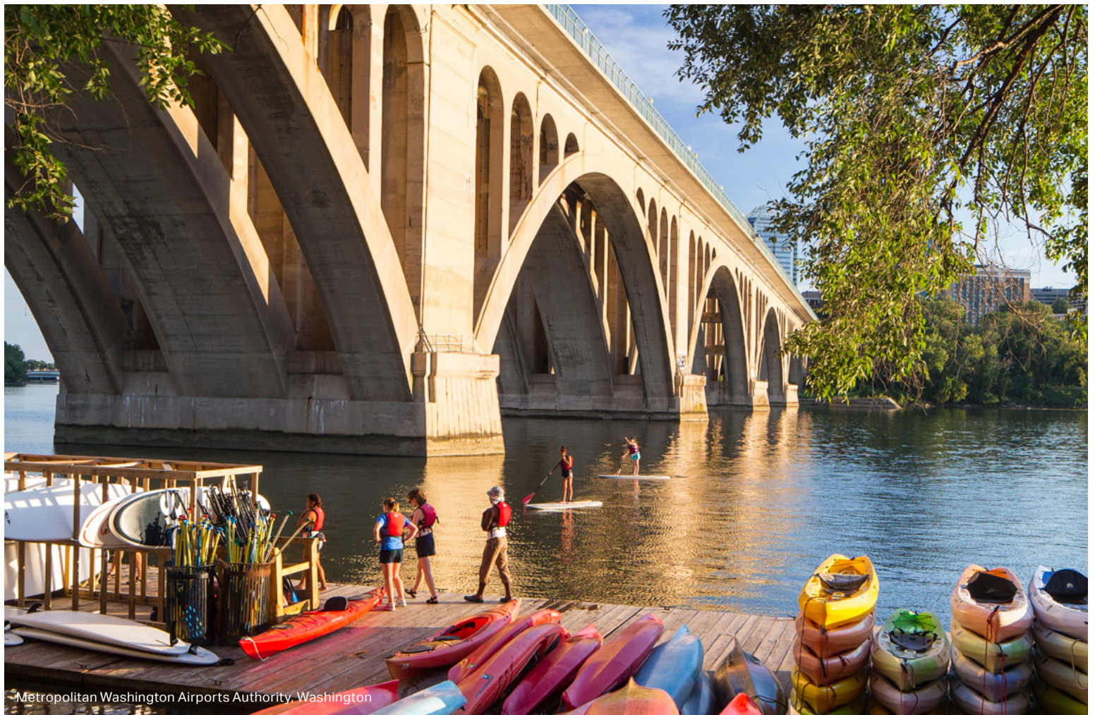
Metropolitan Washington Airports Authority, Washington

Numerous countries, including the United States, United Kingdom, Canada, Australia, Russia, China and other countries in which we conduct business, have enacted laws that strictly prohibit the giving, receiving, offering or soliciting of bribes, kickbacks or other improper payments to government officials. A “bribe” is anything of value given in an attempt to influence an official’s actions or decisions, obtain or retain business, or acquire any sort of improper advantage (such as obtaining information that is normally unavailable or being allowed to submit a late bid or proposal). To be clear, “government officials” include federal, state, provincial or local government employees, political candidates and even employees of businesses that are owned by a government. At AECOM, we also prohibit acts of “commercial bribery,” or offering or accepting a bribe to or from our customers, suppliers or anyone working on their behalf with the intent of obtaining or retaining business.