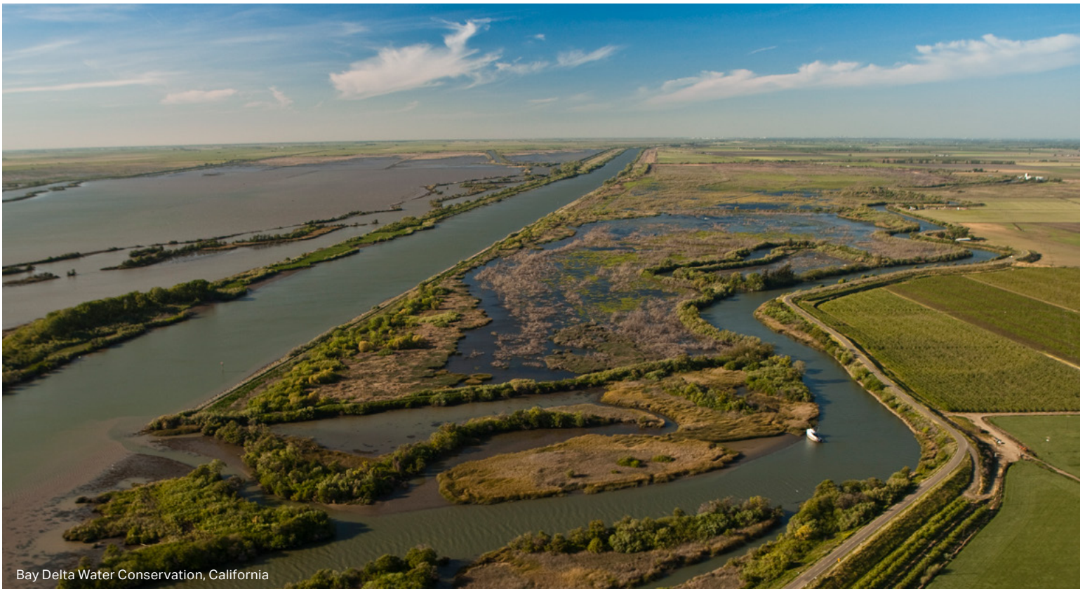
Bay Delta Water Conservation, California

In order to serve our business partners to the best of our abilities, we must always be truthful about what AECOM can and cannot achieve. Any time we discuss our capabilities, credentials, qualifications and corporate history, either verbally or in writing, we must make sure to be honest and accurate. Similarly, we will not make false statements about our competitors or their services, or use unfair practices against competitors, such as obtaining their confidential information.