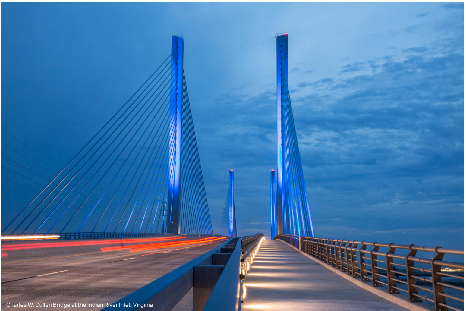
Charles W. Cullen Bridge at the Indian River Inlet, Virginia

Our commitment to ethical business conduct requires our business transactions to be authorized and legitimate. To be clear, we may not engage in any of the following activities: