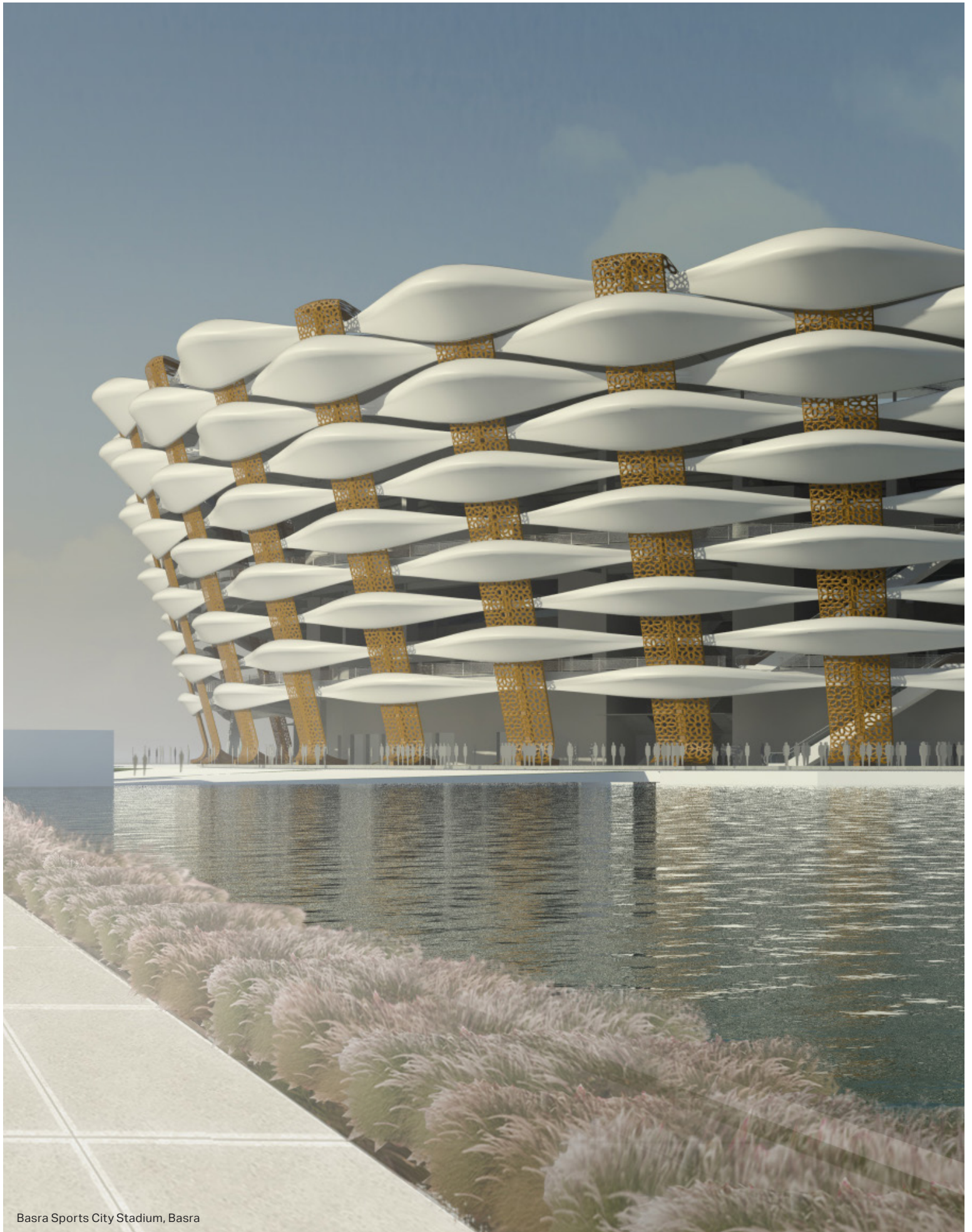
Basra Sports City Stadium, Basra