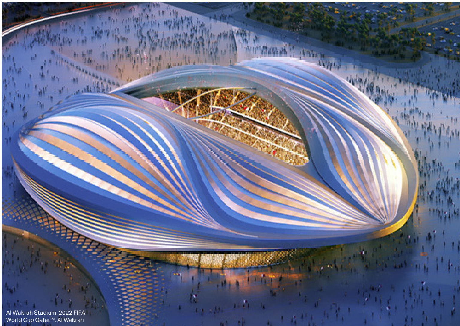
Al Wakrah Stadium, 2022 FIFA World Cup Qatar™, Al Wakrah

ETHICS IS BOTH OUR BIGGEST OPPORTUNITY AND BIGGEST RISK.