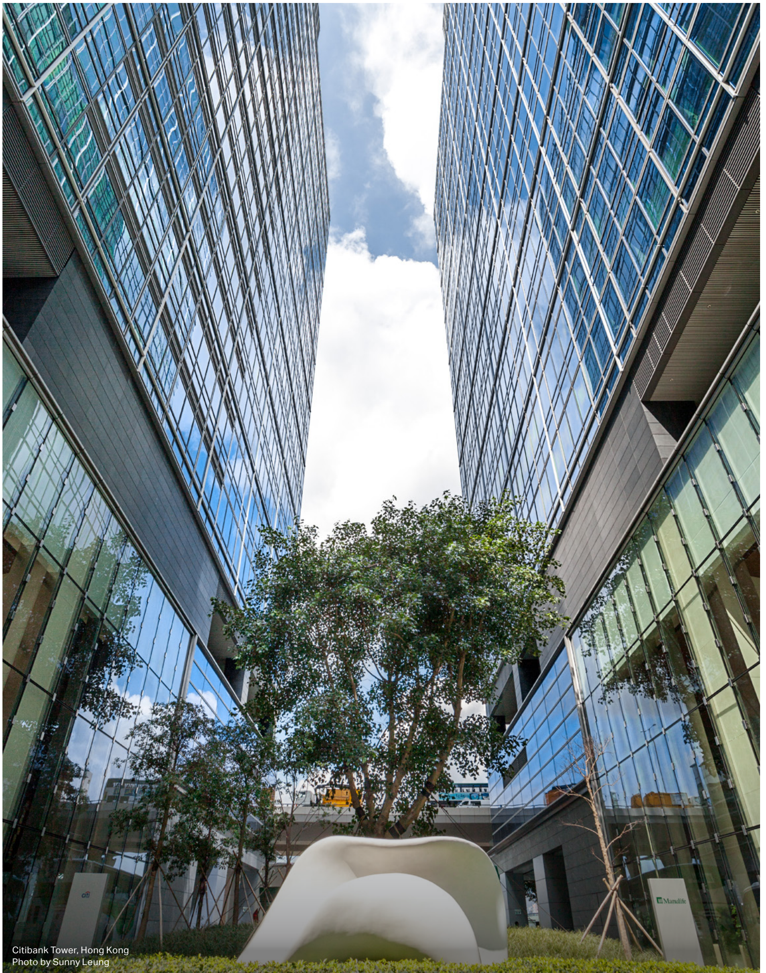
Citibank Tower, Hong Kong