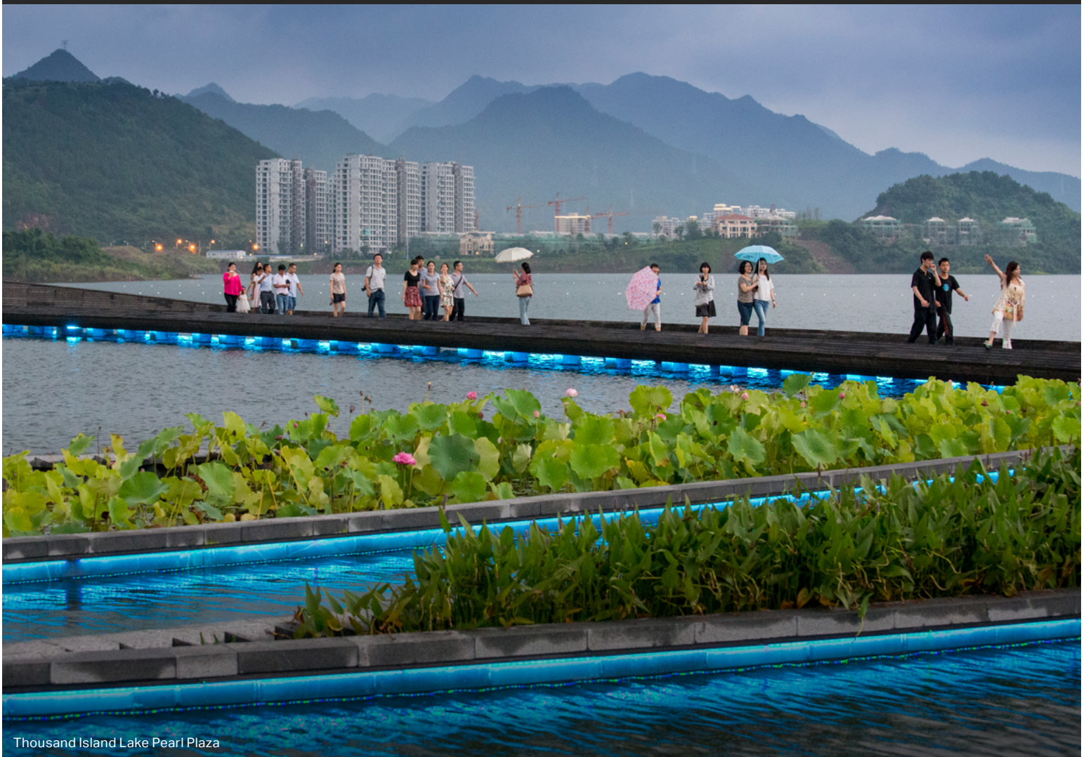
Thousand Island Lake Pearl Plaza