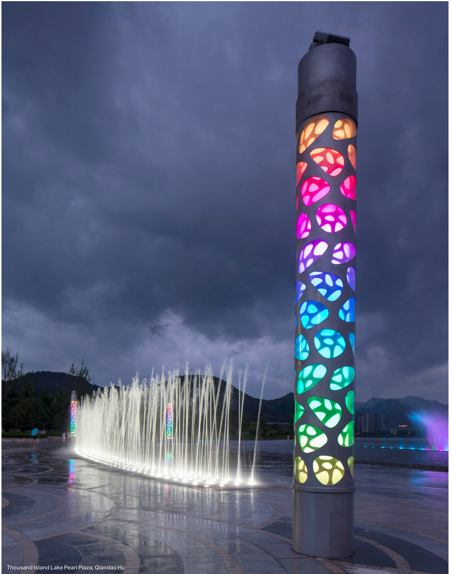
Thousand Island Lake Pearl Plaza, Qiandao Hu