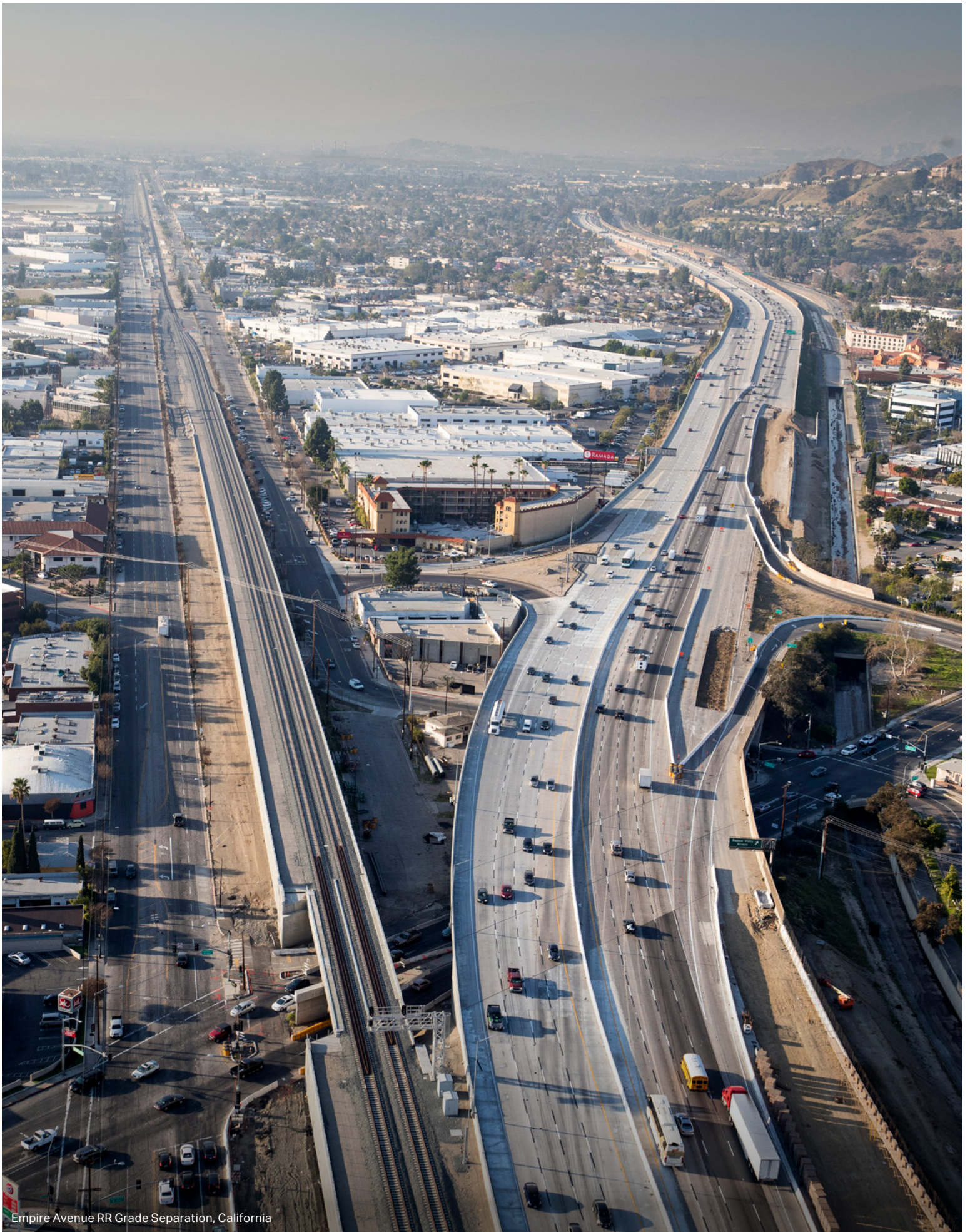
Empire Avenue RR Grade Separation, California