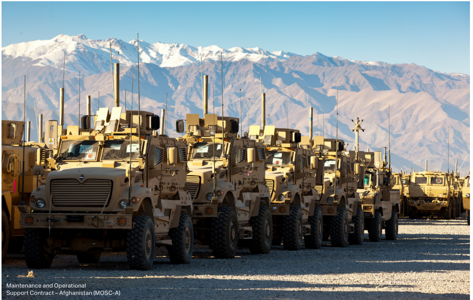
Maintenance and Operational Support Contract – Afghanistan (MOSC-A)

information for another business. Further, we cannot accept employment from a supplier or competitor of AECOM without an express written waiver from In-House Counsel. In any case, prior written approval from In-House Counsel is required before performing any outside work.