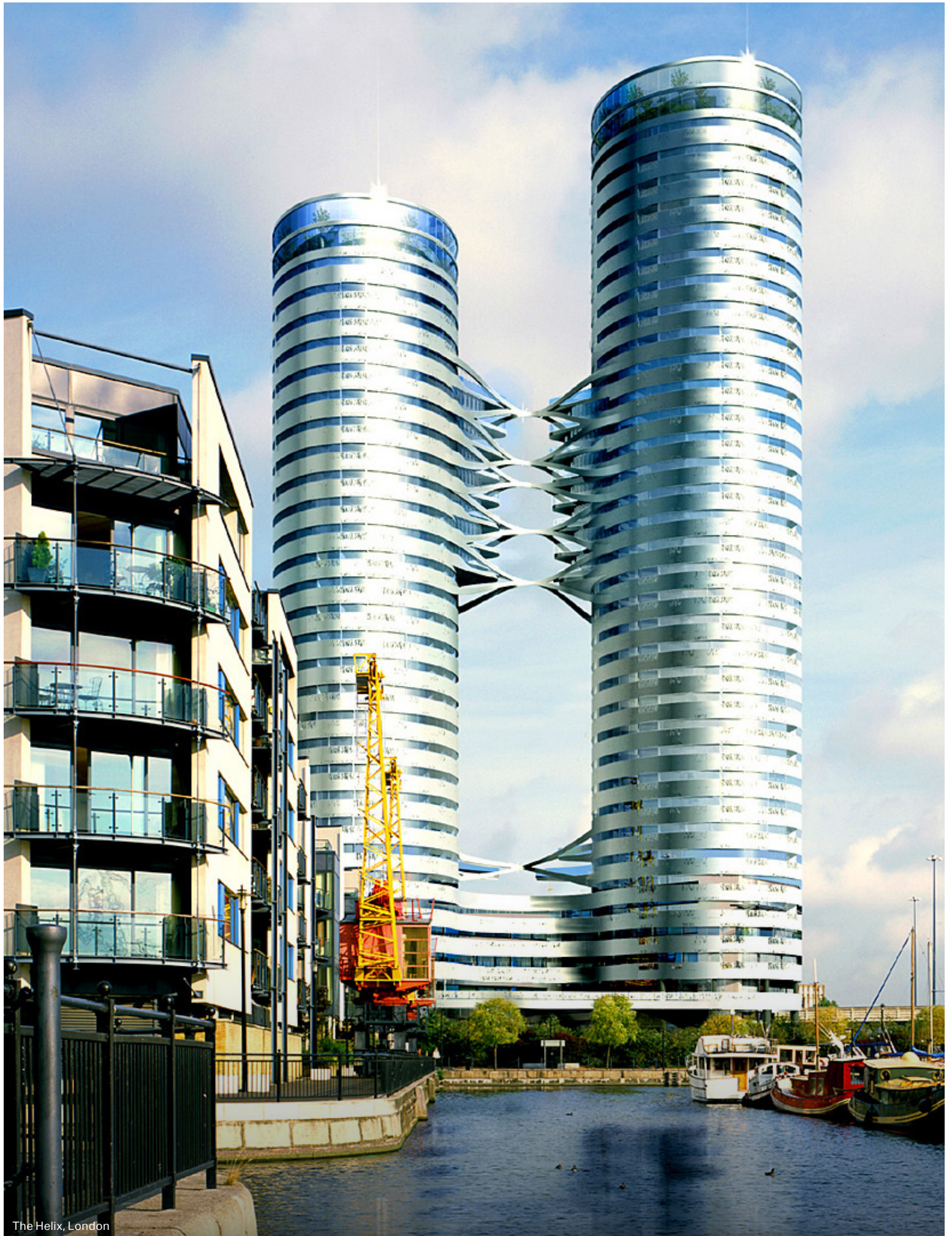
The Helix, London