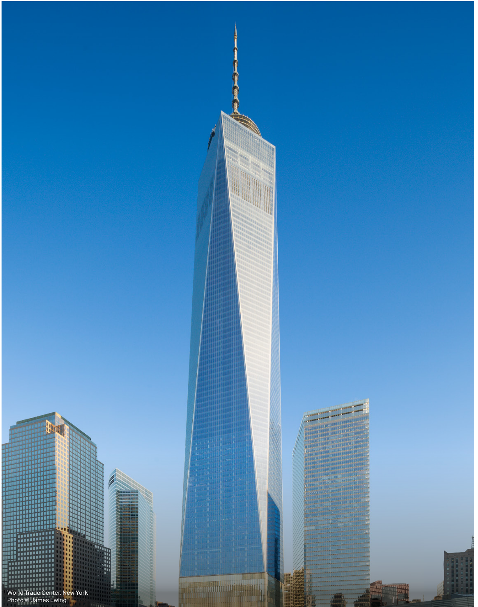
World Trade Center, New York