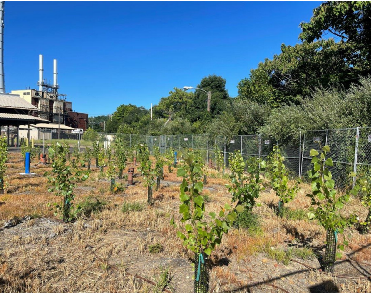
Natural Remediation using Salt-tolerant Trees