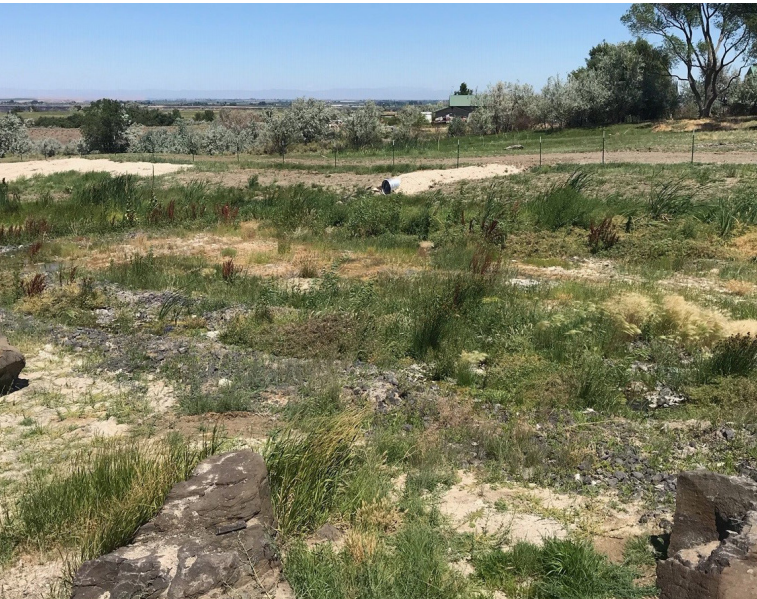
Natural Remediation using Indigenous Grasses