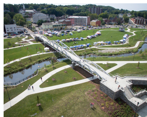
Vibrant Flood-controlled Public Space