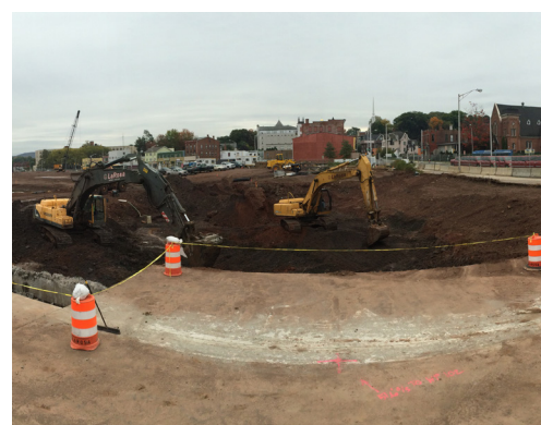
Flooded 14-acre Industrial Park