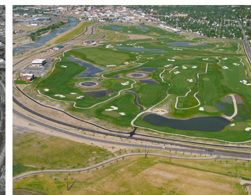
Golf Course, River Park & Business Park