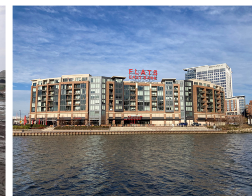
Entertainment Destination & Neighborhood