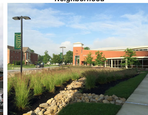
University Rec Center & Sports Complex

More Information: AskEnvironment@aecom.com