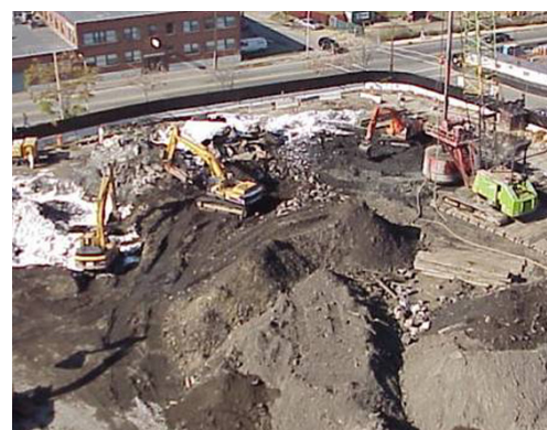
Former MGP Site