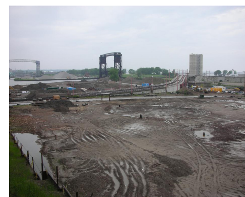
Former MGP and Industrial Site