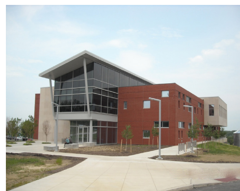
Health Care Education Center