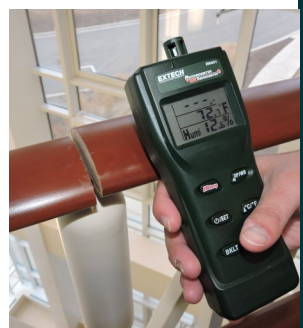
Very low humidity in the winter months created a permanent, very large gap in the railing.