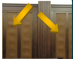
Permanent expansion to millwork panels because of HVAC system shutting down at 10pm and the weekend.