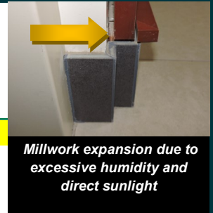
Millwork expansion due to excessive humidity and direct sunlight

○ Also, discuss transportation with the Contractor.