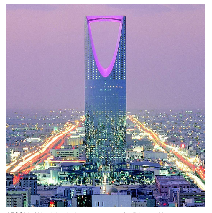
AECOM will lead the design, transport and utilities backbone infrastructure for NEOM, a new model for urbanization and sustainability located in the northwest region of Saudi Arabia.

Another great example is the work we are doing in Bronzeville, Illinois, a neighborhood on the southside of Chicago. Working with ComEd and the Chicago Housing Authority, we are developing the first renewable powered microgrid in this underserved community. This project will help address transportation, electrification, and broader community benefits such as jobs and education. At the same time, energy-saving programs are helping residents and businesses reduce their utility bills, while other initiatives are creating jobs, training the future workforce, and preparing low-income high school students for careers in science, technology, engineering, and mathematics (STEM).