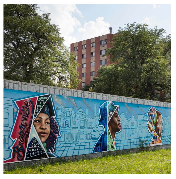
AECOM remains a worldwide leader in building and maintaining sustainable infrastructure as seen by our Chicago site.